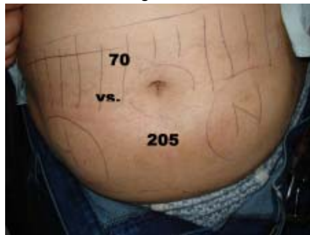
Figure 1. Hypertrophic below navel areas somewhat reddish and warmer by comparison with the above navel areas.

205u/day in order to maintain the same glycaemic values. This schedule had been self made, bases on his selfmonitoring. The inspection of the areas below the navel, where he had been heavily injected for decades, showed some reddish, warmer hypertrophic areas, spontaneously painless, except when injected. Palpation revealed some deeper nodular entities (Figure 1).