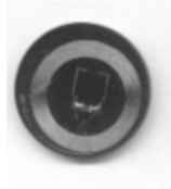
An RFID tag and its antenna embedded in a plastic container

Here I have chosen to exemplify with RFID (slide 1), mainly because it is a growing technology and it is the field in which I have a direct experience.