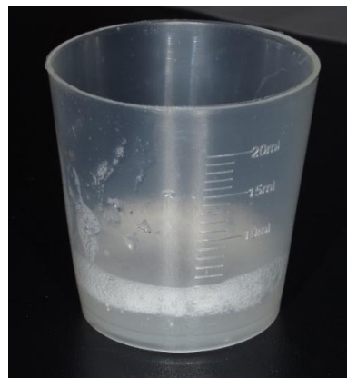
Figure 1. Collecting saliva.

was: “Which is your main complaint” (comments)?” The quantity of saliva was assessed to find out if the hyposalivation or xerostomia are present or not. The saliva was collected by using the Saliva –Check Buffer (GC- Japan). The patients were instructed to chew a piece of wax to stimulate the salivary flow. After every 30 seconds the patient spat the saliva in the graduated glass. The saliva was collected for 5 minutes into this graduated glass (Figure 1). The collection of the saliva was realized by an experienced prosthodontist (no.1). The glucose level for each patient was determined by another experienced prosthodontist (no.2). The check-up after one year of service was realized by the experienced prosthodontist no.1.